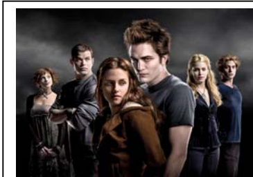
The sezzzy cast of Twilight