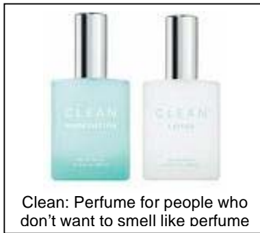
Clean: Perfume for people who don't want to smell like perfume

Lancome Oscillator Mascara MAC's Pro Longwear Lipcolour -- totally smudgeproof Prescriptives customizable lip gloss Jessica Simpson's perfume Fancy -- sample it before it comes out in the September issue of Glamour MAC cosmetics and DJs Andrew Andrew videos Clean Perfume: Shower Fresh and Warm Cotton