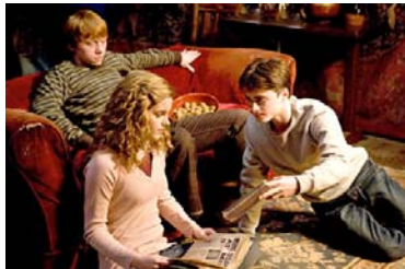
Half-blood and pals