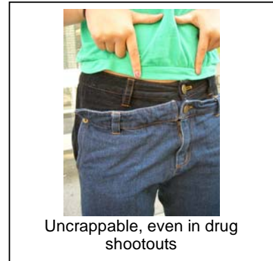
Uncrappable, even in drug shootouts