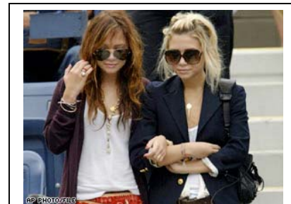
Teens take note: modesty is the new sluttiness.