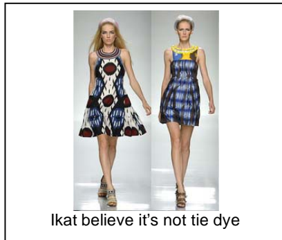
Ikat believe it's not tie dye

PONY sneakers Ban.do headbands Ralph Lauren's look for the Olympics Opening Ceremonies Open source sewing Alexander Wang Bebaroque hosiery Dark fall purples Extra high stilettos Tailored looks with curves, built-in hips Ikat fabric (silk/cotton dyed)